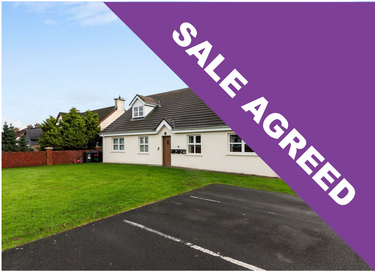
6 Ballycorr Green, Ballyclare, BT39 9DE